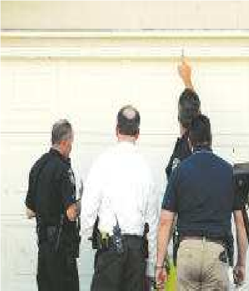
Vacaville police officers on Monday examine a bullet hole above the garage of a home in the 100 block of Rocky Hill Road.