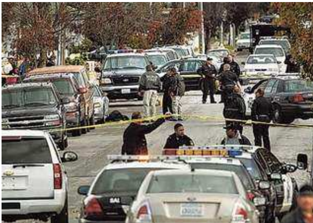
Police secure scene of fatal shooting (28 th gang-related homicide)

Five people have been killed by gunfire in Salinas since Nov. 29.