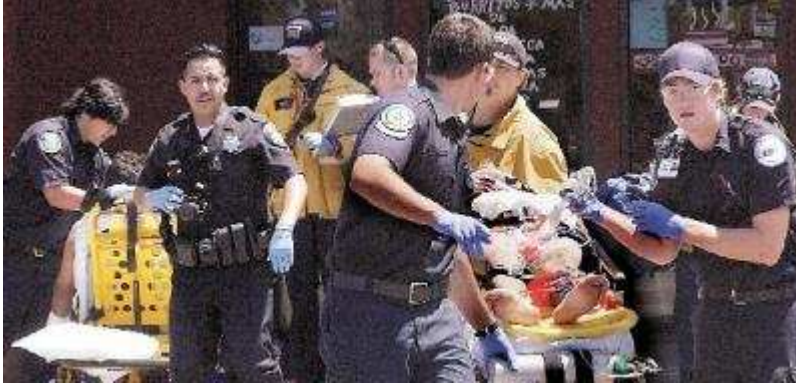
North Sanborn Road shooting victim being rushed to hospital