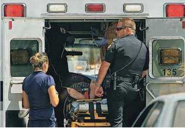
Gardner Ave. shooting victim taken to hospital